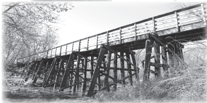
Photos: Top Right: Bridge south of Bear Creek to be replaced. Middle: Light shines through a hole in the Prairie Creek Bridge. Bottom: Bear Creek (Midpoint) Bridge.

Approximately ten miles of the CVNT is located in Benton County, Linn County Conservation agreed to maintain the trail during its creation. The CVNT is scheduled for closure north of Urbana in late July and early August as the bridges are repaired.