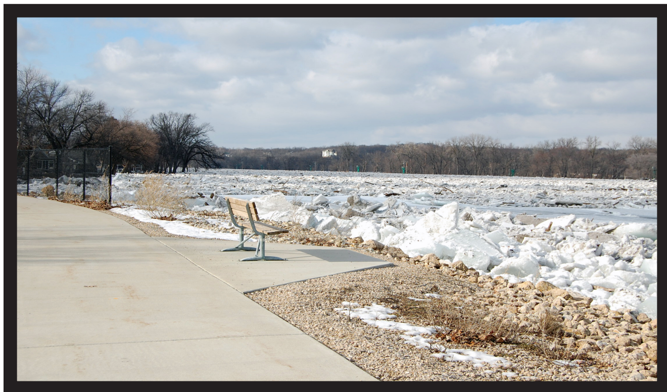
A view from the Ellis Trail of the March 2013 ice jam on the Cedar River

NON-PROFIT ORG. U.S. POSTAGE PAID CEDAR RAPIDS, IA PERMIT 291