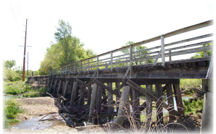
Bridge of East Blue Creek on the Cedar Valley Nature Trail (above)

In December 2016, Linn County Conservation closed a section of the Cedar Valley Nature Trail for the replacement of the West Blue Creek Bridge. The two hundred and seventy foot bridge located near mile marker 15 was built in early twentieth century. The project involves the removal of the existing timber stringer bridge and the construction of a new 16 foot wide concrete beam and concrete deck bridge. Completion of the bridge could happen late spring 2017. Until then, the trail is closed from Urbana Road (County E2W) to 56th Street drive in Benton County until the project is completed.