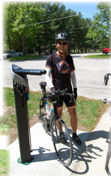
A rider takes advantage of the Fixtation at the Boyson Road Trailhead (above). Each station has a selection of tools for use (left)