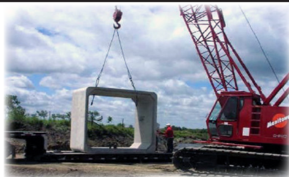
County Home Road culvert placement during the 2004 paving of the Cedar Valley Nature Trail.

In the early 1990's, Black Hawk County paved several miles of the Cedar Valley Nature Trail. At the same time, the Linn Conservation Board expressed a desire to pave the trail in Linn County. The LCTA established a "Pave the Cedar Valley Nature Trail" committee in 1993 and supported a 1994 grant application for the initial paving project. The organization elected to focus its fundraising efforts toward the construction of a new trail through Cedar Rapids, the beginning of the Cedar River Trail. Lack of funding and attention to new trail creation led to the majority Cedar Valley Nature Trail remaining crushed limestone for almost a decade.