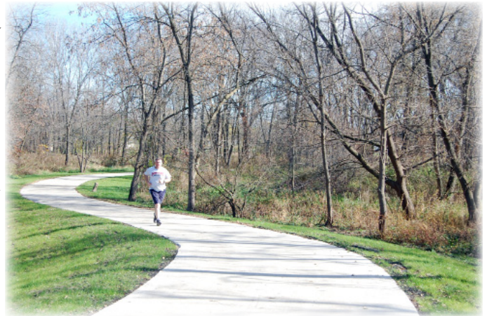
A runner uses the new trail connecting South Troy Park and the Cedar Valley Nature Trail (above) The new bridge over Dry Creek (below)

In 2012, the City of Robins also received a $204,000 Iowa Department of Transportation State Recreational Trails grant for the construction of the South Troy Park Trail and bridge. With REAP (Resource Enhancement and Protection) funding, the city purchased additional land adjacent to South Troy Park. The South Troy Park Master Plan included additional baseball/ softball fields, additional green space and a trail connection to the Cedar Valley Nature Trail. The new 3,400 ft. trail includes a bridge over Dry Creek and opened in late 2016. More parking is available within South Troy Park. The city encourages trail users to park their vehicles in South Troy Park and no longer