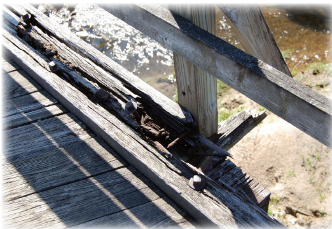
East Blue Creek Bridge damage

The improvements are part of a 2014 initiative presented to the Iowa State Legislature entitled: Linking Eastern Iowa Communities with Trails: The Waterloo, Cedar Rapids, Iowa City to West Branch Connection . Three Eastern Iowa counties, Black Hawk, Linn and Johnson, asked the state for $8.2 million to help complete a network of trails local officials called critical to recreation, tourism, economic development and workforce development. The plan is to connect the Cedar Valley Nature Trail from Cedar Falls to Cedar Rapids to the Hoover Nature Trail south to Solon and West Branch on to Muscatine and Burlington. This includes peripheral connections to trails in Bremer and Buchanan counties to the north as well as to Iowa City, Coralville and North Liberty.