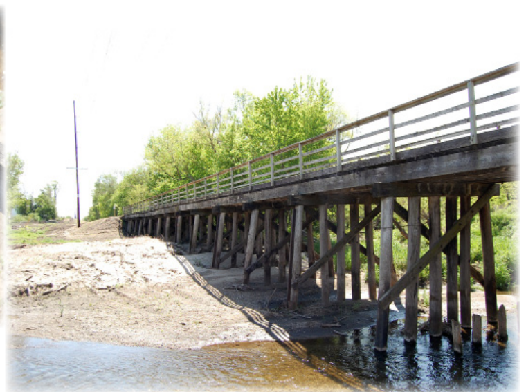
West Blue Creek Bridge on the Cedar Valley Nature Trail