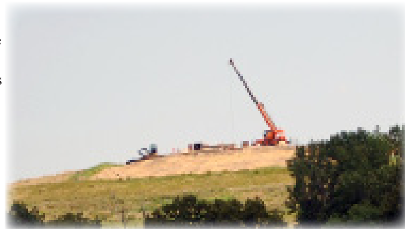
Construction of the "Site 1" overlook during the summer of 2017 (above)

In the beginning of 2017, the City of Cedar Rapids and the Linn County Solid Waste Agency commenced a project to repurpose the county's initial landfill. In 1965, the Otis Quarry began its transformation into the current 208 ft tall formation as it exists today. With the closure of the landfill site in 2013, the city of Cedar Rapids and the Solid Waste Agency began the process of repurposing the area as a "passive recreational" site. The focus of the plan would establish the summit as a destination for those visited the area.