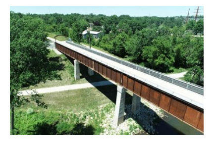
Indian Creek Bridge- old railroad bridge redone!