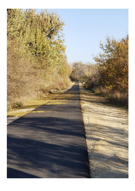
Freshly paved section of trail section of GWT looking east from Hindman Rd towards Oxley Rd.

What's next? In 2024 the paved trail will be extended further east from Oxley Rd. to Creekside Dr. and in 2025 the Connection will be complete on the west end from Council St. to the Cedar Valley Nature Trail at Center Point Rd!