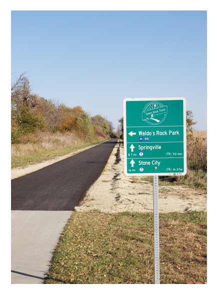
Going East from Marion the GWT is now paved from Waldo Rock to Oxley Road! Thanks Linn County!

Fresh paving on Grant Wood (aka Lindale) Trail Extension from C Ave to Council Street - Photo below looking north from south side of Blairsferry Underpass! Wow we are under!