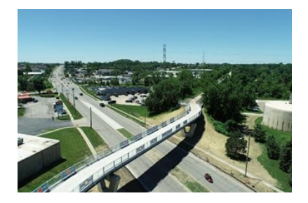
Marion Boulevard Bridge - beautiful design and artistry

2022- The City of Marion completed the bridges over Indian Creek and Marion Boulevard, Constructed the trail through the City, paved the portion west of the two bridges to Lindale Drive in the fall. The City of Cedar Rapids extended the trail to the west from C Ave to Council Street including an underpass at Blairsferry Rd. Linn County Conservation extended the paved portion of the trail to the east from Waldo's Rock Park to Oxley Road.