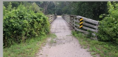
CEDAR VALLEY NATURE TRAIL REOPENS Bear Creek Bridge

The Cedar Valley Nature Trail has reopened at Bear Creek. The bridge project at the Benton/Buchanan County line replaces a structure originally built 110 years ago on the WCF&N Railway.