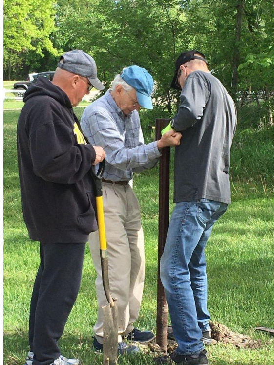
Thanks to the Trail Counter Committee who tirelessly places and replaces trail counters. Trail counts are very important when requesting funds for trails! (above)