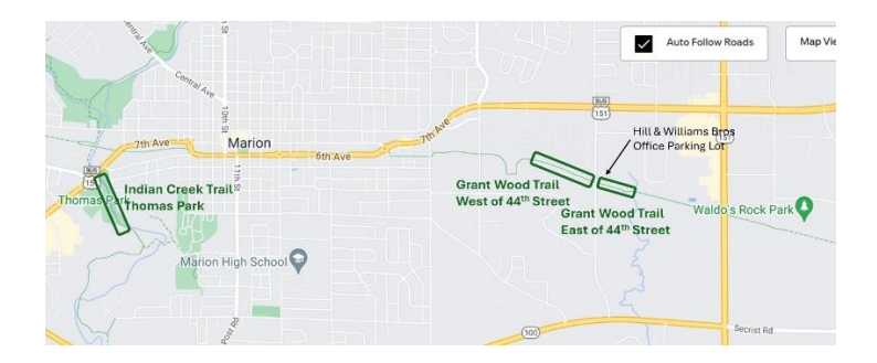
Help - 20 to 30 Tree Planting Volunteers Needed

Thanks in large part to a $5,000 grant from Iowa Department of Natural Resources, LCTA in collaboration with City of Marion, Iowa Government will be planting 71 trees along the Grant Wood and Indian Creek Trails.