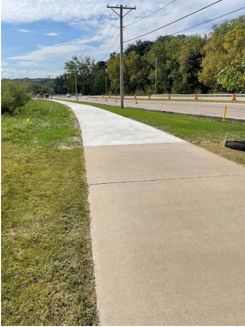
Edgewood Rd Trail looking south from Glass Rd to the Cedar River Bridge