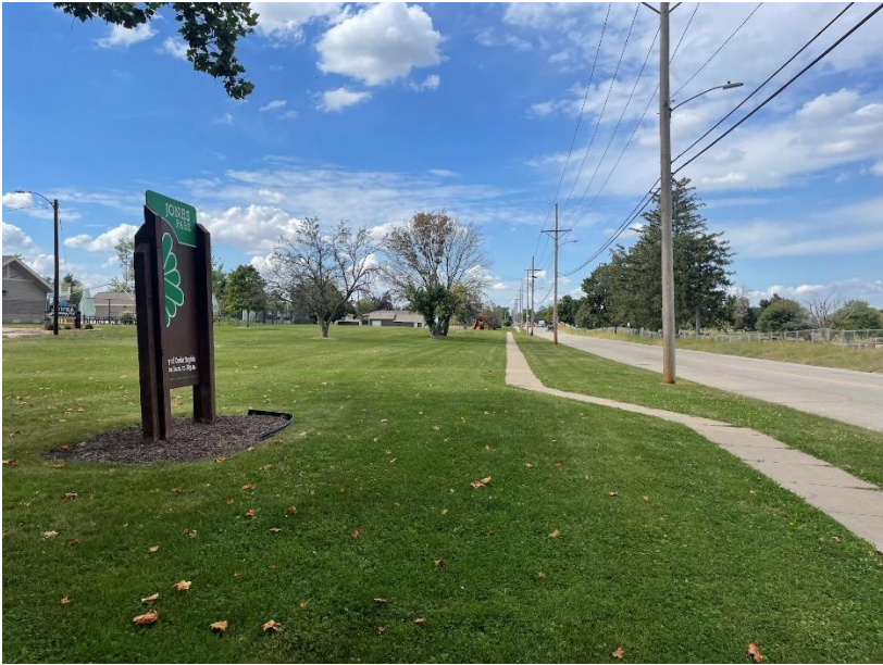
The Connector Trail will cross by Jones Park.

The project from 33rd Ave SW to C St SW is under construction and will be completed by the end of 2024. The trail will be 10' wide and driveways will be modified to allow the trail to pass through at full width. A roundabout is planned for the intersection with Wilson Ave SW. New sidewalks, an uphill northbound bike lane and downhill southbound shared use lane are also part of the project from Wilson Ave SW to C St SW.