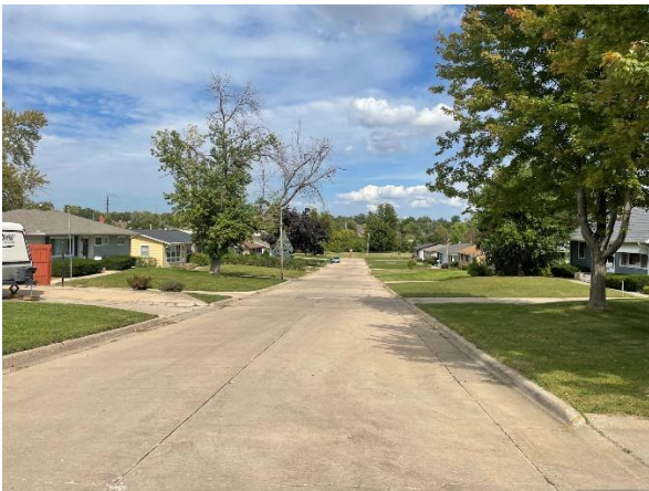
From Johnson Ave looking north 32nd St NW Cherokee Trail route before the Vinton Ditch

Design work for Phase III from Edgewood Rd NW to 13th St NW has started with construction expected in 2025. The alignment will continue from Edgewood Road NW along Johnson Ave NW to 32nd St NW then head down 32nd St NW to cross through the Vinton Ditch Greenbelt to E Ave NW. Then on the 27th St NW to F Ave NW. Continue along F Ave on the South side to 13th Ave NW. (See pictures below)