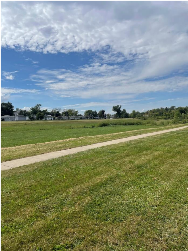
Vinton Ditch Greenbelt by E Ave NW