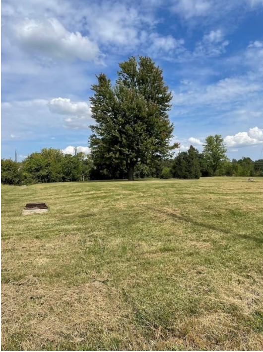
Vinton Ditch Greenbelt at 32 nd St NW