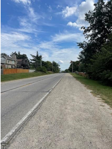
F Ave towards 13th Ave south side of the road (continuation of the Vinton Ditch is on the right)