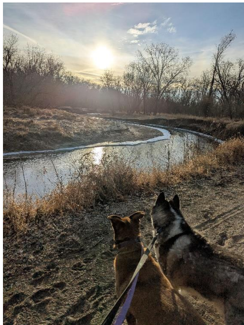
Buddies Overlooking Indian Creek the Sac and Fox Trail

Last month, the Sac and Fox Trail celebrated the 50 th year anniversary recognized as a National Recreation Trail, the oldest such designated trail in Iowa.