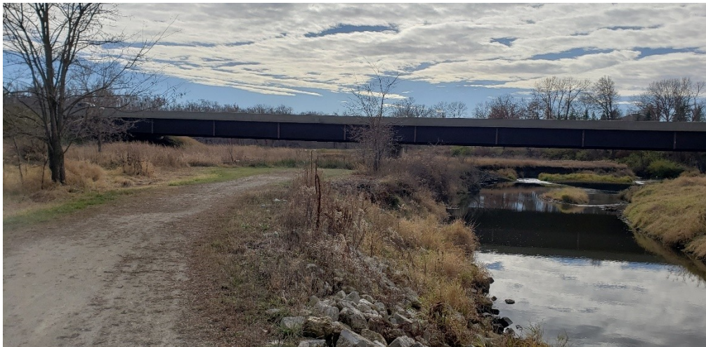
CEMAR looking south towards HWY 100, Indian Creek and Cedar Rapids

Have we got a LOT of events for the Spring, Summer and Fall